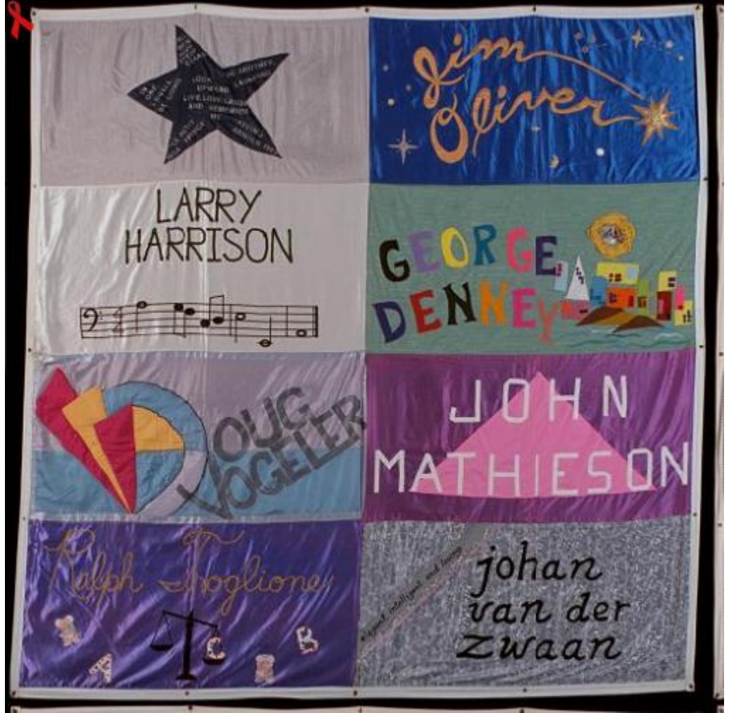
Names(panel number) on Block # 103

Leader -3: Hello. My name is _____. I am in_(city) _____, _(State)____. Scroll the page to see the panel names on Block # 103.